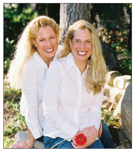
The Energy Twins launch another successful allergy-free cookbook

Because pre-orders for the new book have been so high, they intend to con-