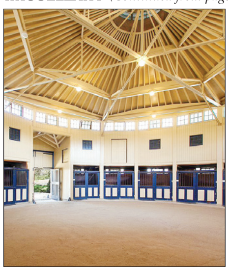
Equestrian facilities at the sprawling estate

long oak bar. Below it is a badminton court.